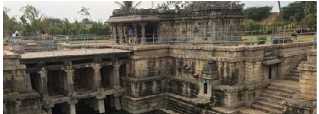
Manikeshwara Temple in Lakkaundi in Gadag