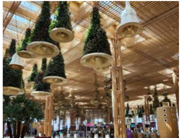
Bengaluru's Kempegowda International Airport's Terminal 2 has won the World Special Prize for an Interior 2023, making it the 'World's most beautiful airport'

The latest award to be bestowed on KIA is a special prize at UNESCO's 2023 Prix Versailles. The award recognizes the intelligent sustainability as a cultural driver, innovation, creativity, reflection of local heritage, ecological efficiency and values of social interaction in the designing of the T2 terminal at KIA.