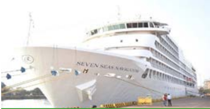
This season's 1st cruise, The Seven Seas Navigator docked at New Mangaluru Port in early Dec 2023

THE 1st of 10 cruise ships to arrive in this year, the majestic 'Seven Seas Navigator' called on Mangaluru Port in early December 2023 bringing with her 500 tourists and team of 350 crew members. The momentous occasion signifies a resurgence of maritime tourism in the region, much to the delight of local businesses and stakeholders.